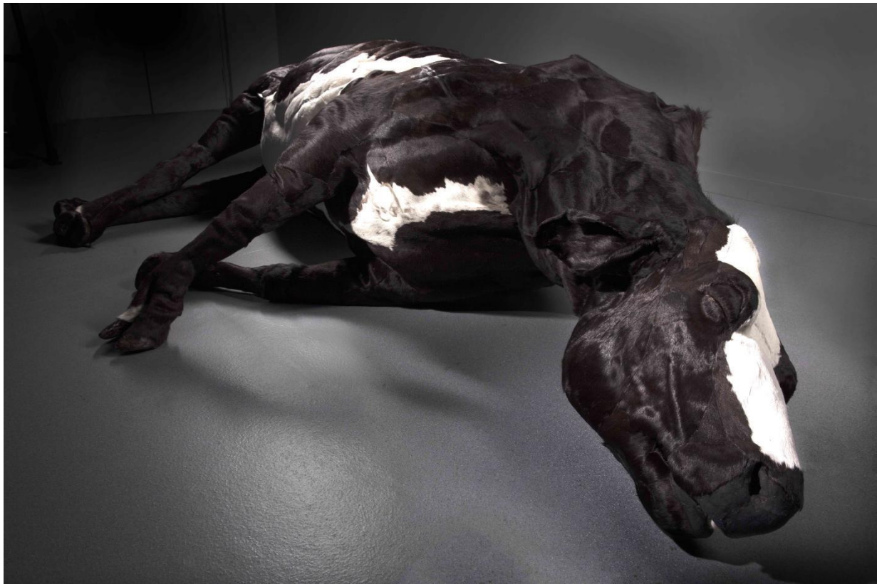
Abigail Norris, Cow (Awaytn the Sāwol) , 2022, reclaimed floor rugs, domestic materials, 85 X 288 X 215 cm.

The Brink is an expansive exhibition of 21 artists, both established and early-career, whose works range sculpture, installation, painting, and performance, all set within the space of a formerly dilapidated tannery.