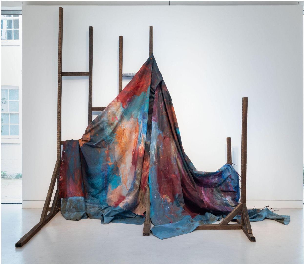
Jo Dennis, Betty , 2023, oil, acrylic, household and spray paint on military surplus tent canvas and reclaimed wood, 310 X 320 X 150 cm.

Using a stripped back site as a way to explore the idea of place and conversely, non-place. Sites like this are often liminal spaces, which means that they are in-between places. They are not fully public or fully private, not fully built or fully natural. This liminality creates a sense of disorientation and alienation, which is used as a point of departure for exploring the complex and often contradictory ways in which we experience space, and to consider the ways in which place can be shaped by our personal and collective memories and culture. The works will navigate themes of temporality, mortality, and the relationship between the individuals and the spaces they inhabit, as well as the ways in which place can be shaped by memory, history, and mythology.